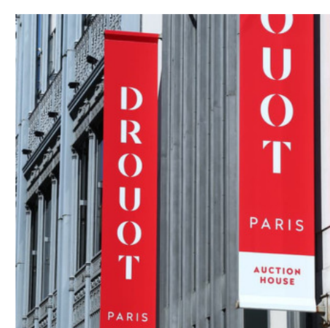
ART District 13. International Art Fair 25 – 29 Sep 2019 at District 13

ART Caravaggio's Roman Period 21 Sep – 28 Jan 2019 at Musée Jacquemart-André